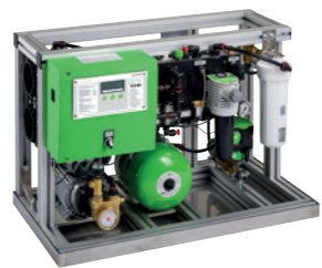
Reverse osmosis system GENO-OSMO AVRO 125 RU

The under-sink system is used in doctors' offices and in industry, for instance. It is designed for the demineralisation of raw water whose composition meets the quality requirements of the German Drinking Water Ordinance (TrinkwV).