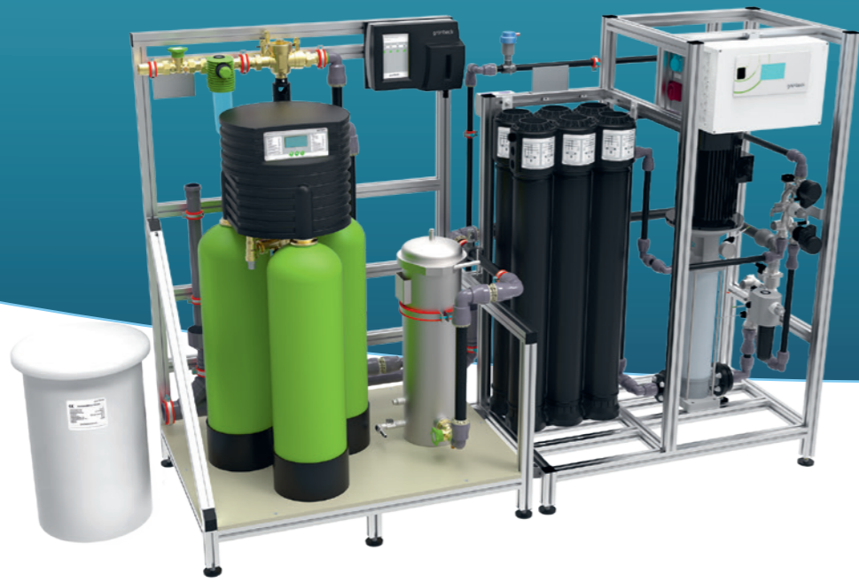
Rack-mounted modular system GENO-OSMO-X p