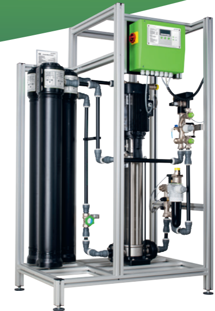
Reverse osmosis system GENO-OSMO-HLX