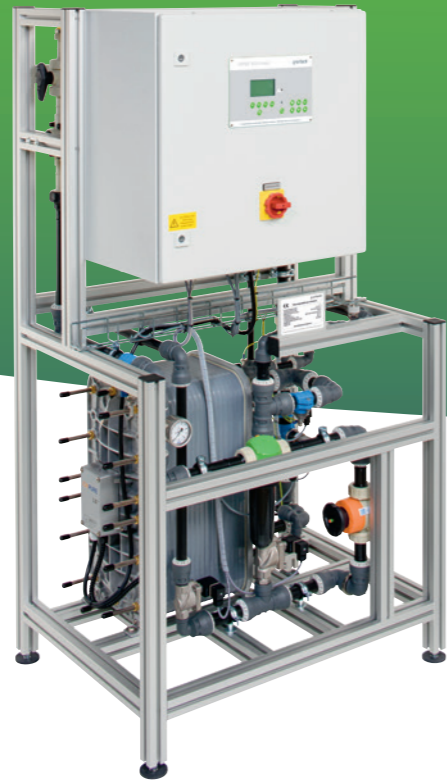
Electrodeionisation system GENO-EDI-X