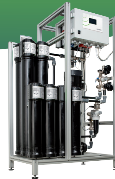
Reverse osmosis system GENO-OSMO-X with AVRO technology

It provides you with pure and ultra-pure water of the highest quality for your industrial or scientific requirements and applications. And as the protection of the environment is as important to us as it is to you, the regeneration takes place without any application of chemicals.