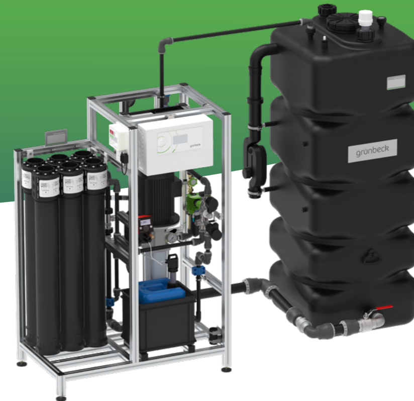
Reverse osmosis concentrate stage osmoliQ:KA